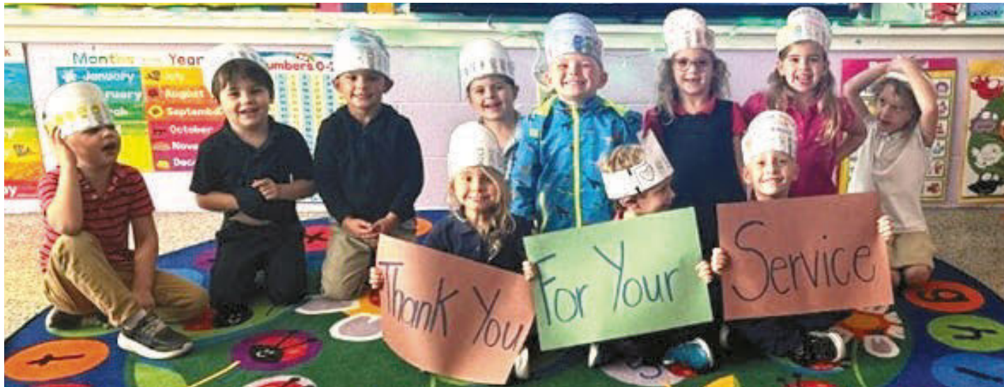
Nativity students thank veterans on Nov 11.