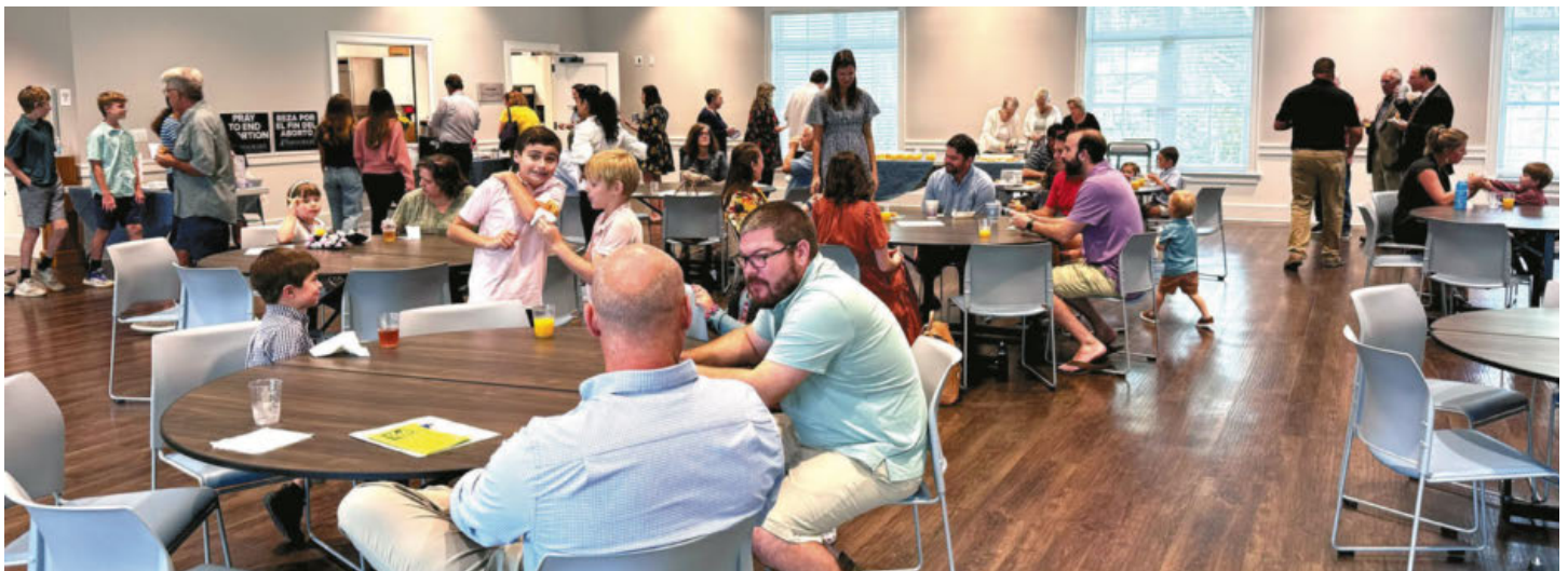
Some of the crowd who enjoyed the Ladies Guild Coffee and Donuts breakfast last Sunday

Thank you for caring for these new mothers and their babies.