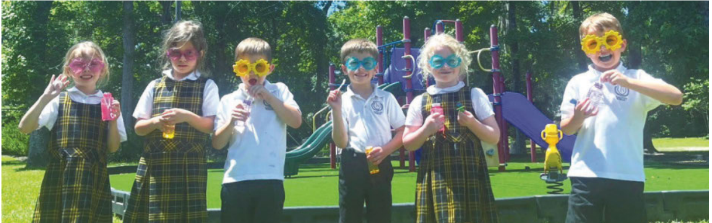
Some of the K5 students celebrated their Graduation to 1st grade.

The School Year is Finished. Have a Great Vacation!