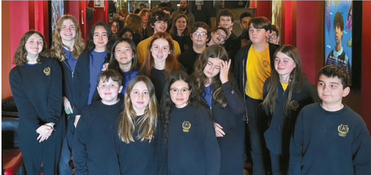
Nativity Middle School Students recently visited the theater to see the movie “Cabrinì”. This highly rated and inspirational movie is a “must see”. “Cabrinì” is still showing at local theaters. Check it out for yourself.