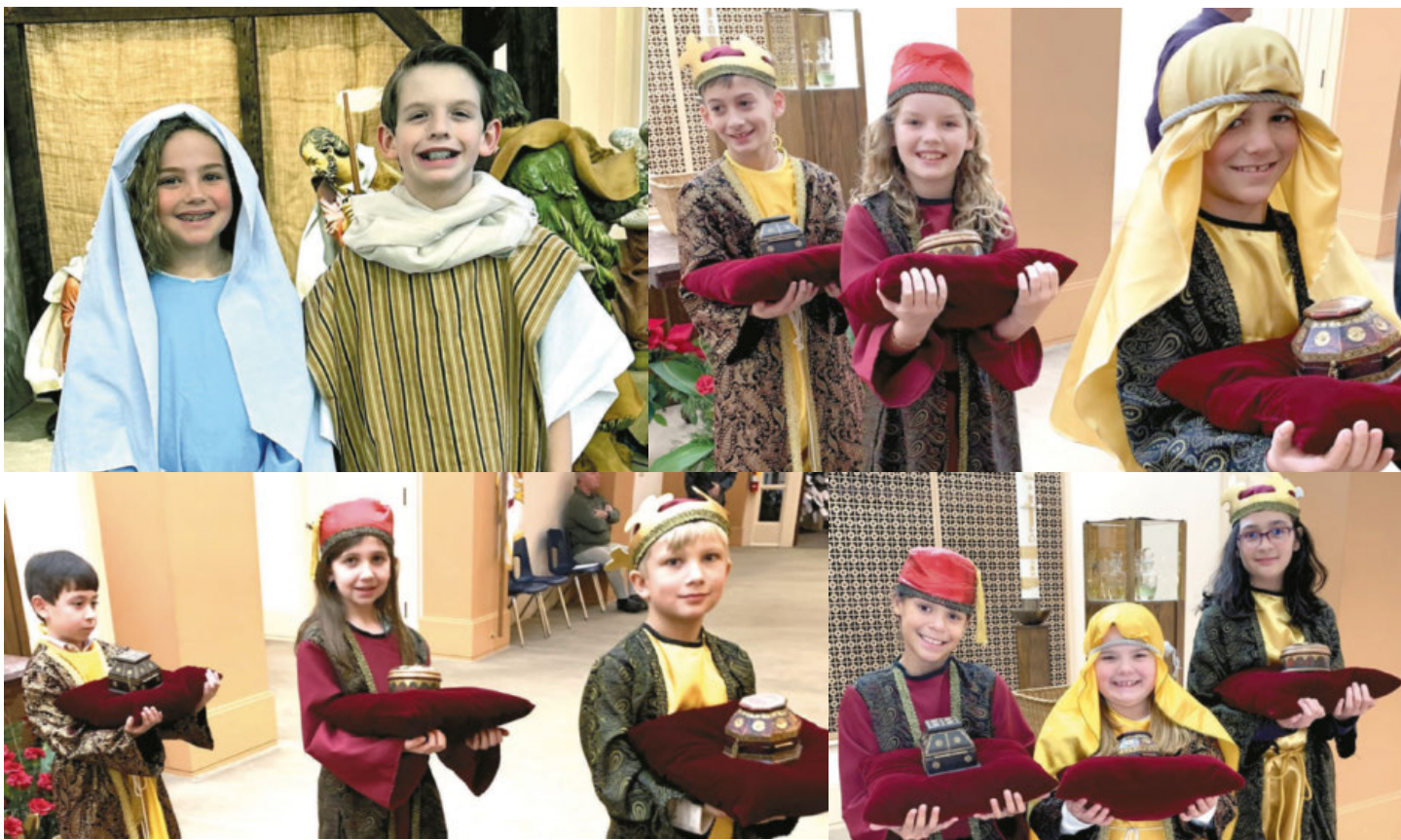
Mary, Joseph and 9 wise persons were numbered among the many Holy People who joined us for worship and fellowship during the Christmas Season. Thank you for celebrating this Holy Season with us!