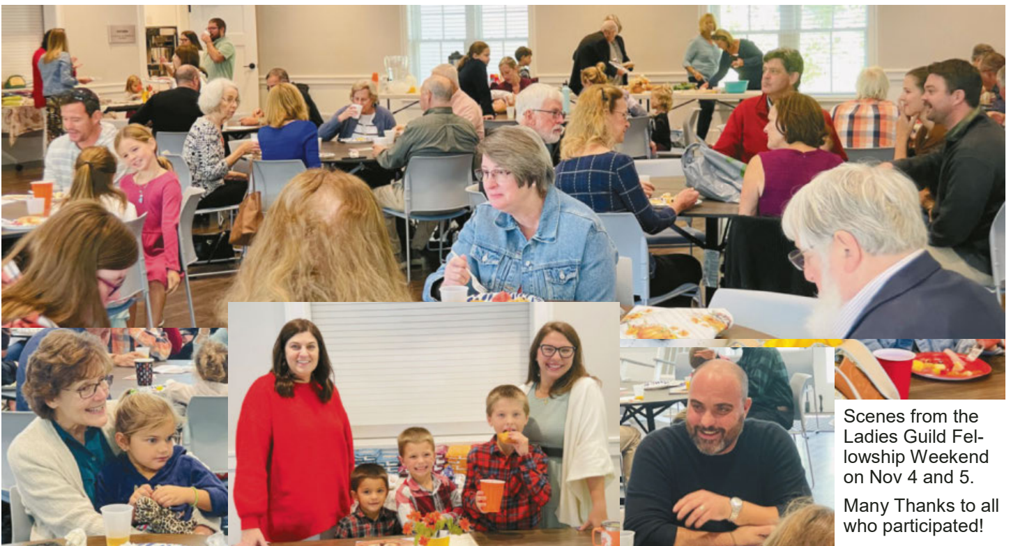
Scenes from the Ladies Guild Fel- lowship Weekend on Nov 4 and 5.

Interested in participating? CONTACT PTO PRESIDENT: SUMMER TURNER AT 843-737-2124 or SUMMERTURNER.MYITWORKS@GMAIL.COM