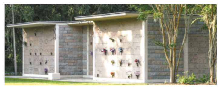
Representatives from Holy Cross Cemetery and Mepkin Abbey will be at Our Lady of Good Counsel on Tuesday, April 25 at 6:00 pm to share information about their respective columbariums.

Please join us in Fr. Kelly Hall (105 West Hudson Avenue) to learn about the many options offered by these organizations