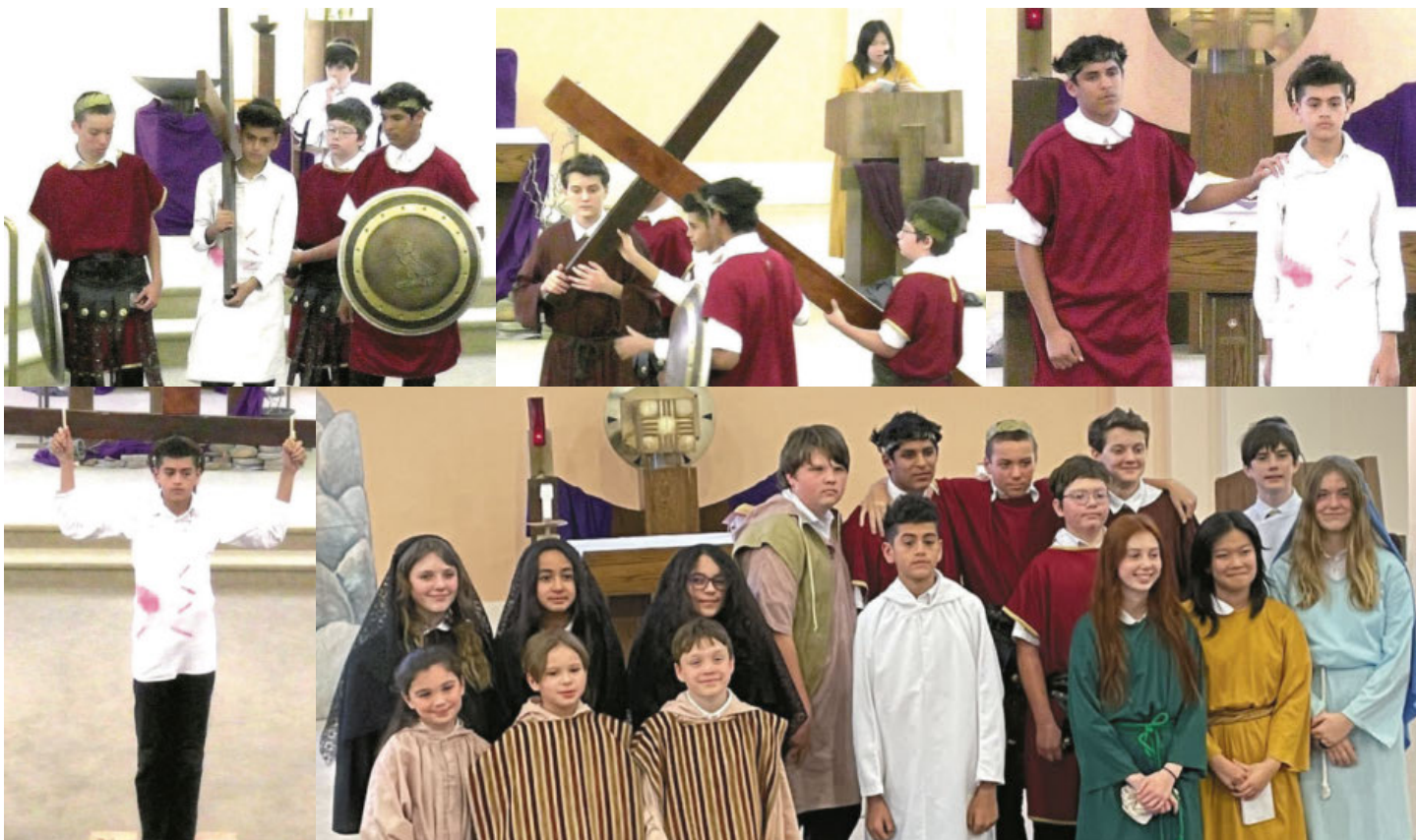
Living Stations presented by Nativity School Students during Lent.

We hope you attended some of our inspiring re-enactments. We cannot wait to see you again next spring.