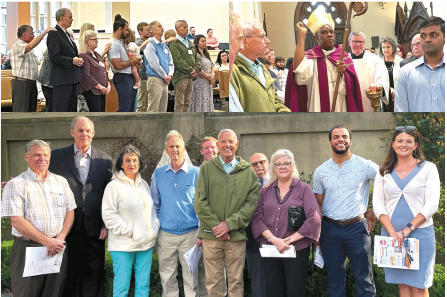
Nativity RCIA Right of Sending and Right of Election on Sunday, Feb. 26.

Thank you for your care and concern for the unborn!